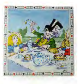
6" Trivet 18