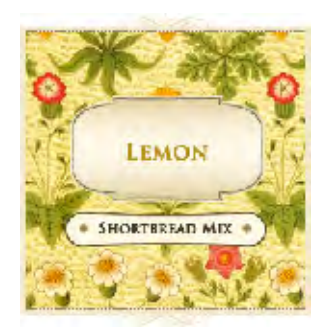
A combination of dark brown sugar and white sugar along with a generous helping of lemon peel help make this shortbread out of this world.