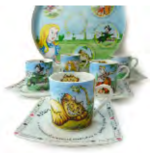
Set of Five 3 oz. Teacups and Saucers with Box 51.