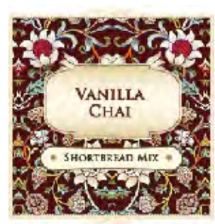
Black tea, chai spice and vanilla give this cookie its own unique signature. Elegant and subtly spicy, it commands rave reviews!