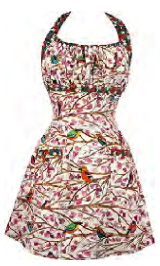
Natura Apron Front

Aprons fit women's dress sizes 4 - 12. Children and plus sizes available in some patterns.