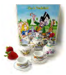
CHILDREN'S TEA SET