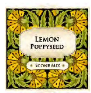
These scones have the light, delicate flavor of fresh lemons and can be sugar-glazed for extra sweetness. 10.