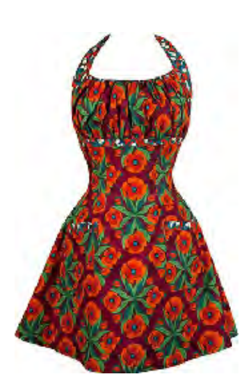
Natura Apron Reverse