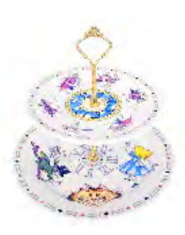
2 Tier Cake Stand 85.