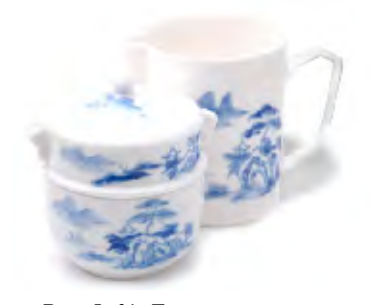
Blue LuYu Teamaster 45.

The LuYu comes in white and hand-painted blue and white porcelain.