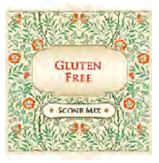
A gluten free version of our traditional butter scone. Delicious as is or can be the base for your favorite scone. 10.