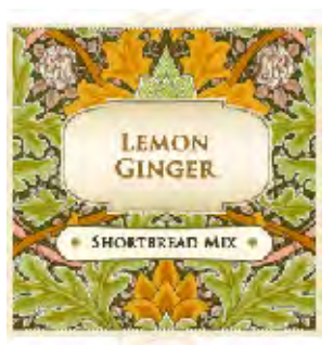
These are a tasty twist on our Brown Sugar Shortbread cookies. They have the cool, crisp flavor of lemon with the subtle after-burn of ginger.