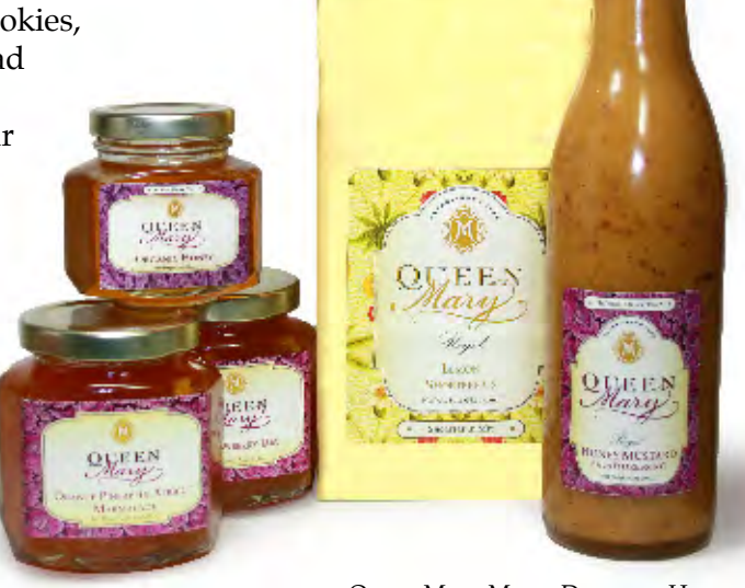
Queen Mary Mixes, Dressing, Honey, Strawberry Jam and Orange Pineapple Apricot Marmalade