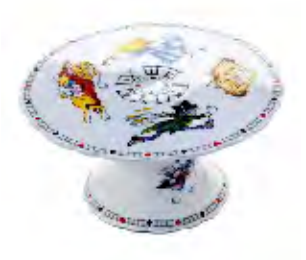
Cake Stand 85