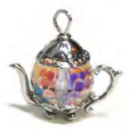
12MM AURORA AUSTRIAN SWAROVSKI CRYSTAL STERLING SILVER 26.