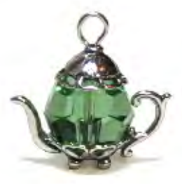
12MM GREEN AUSTRIAN SWAROVSKI CRYSTAL STERLING SILVER 26.