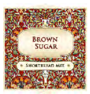
By using brown rather than white sugar, our Brown Sugar Shortbread cookies are a slight departure from traditional shortbread. Delicious!