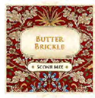
Each scone is speckled throughout with Heath Almond Brickle Chips for a warm, crunchy flavor. 10.