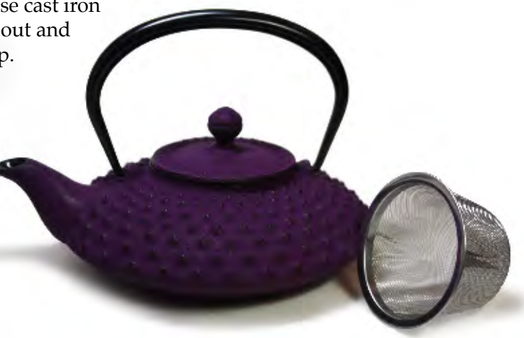
Purple Tetsubin Teapot 116.

They come in black, green and purple. Each has an infuser for easy brewing.