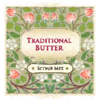
A versatile mix that is delicious as is or can be the base for blueberry, cranberry or strawberry scones.